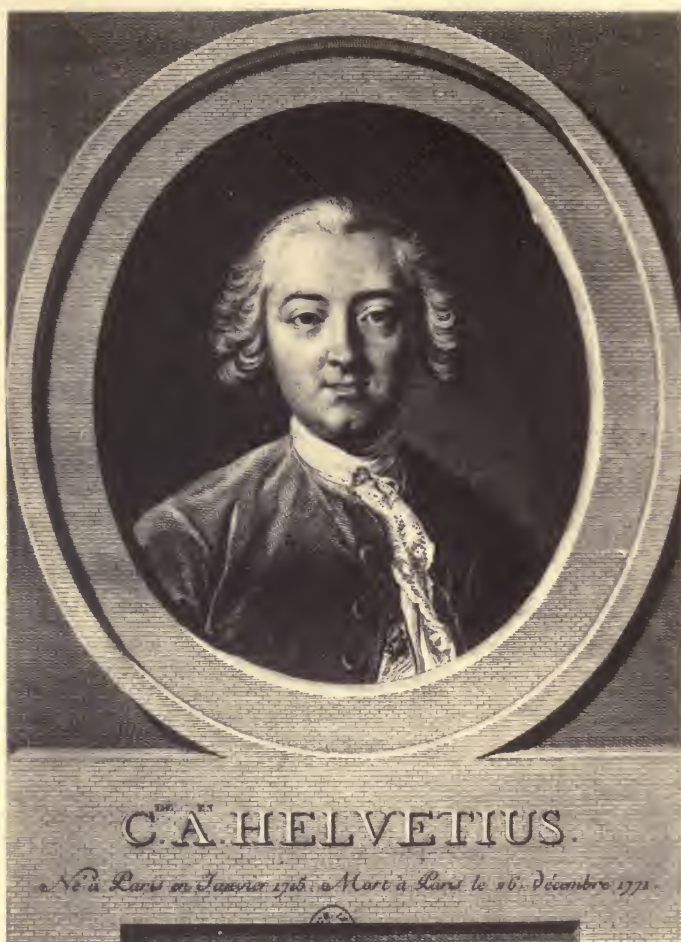
CLAUDE ADRIEN HELVÉTIUS.